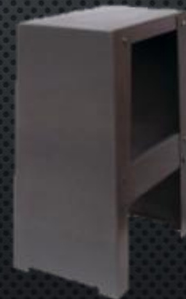
Optional Steel Stand