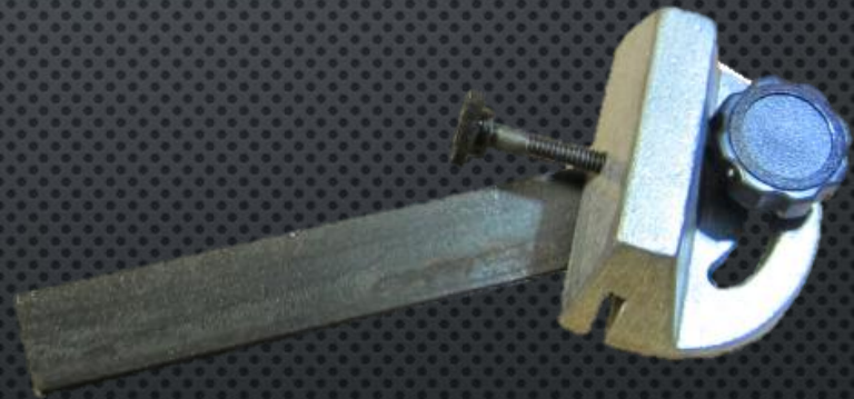
Optional Mitre Gauge