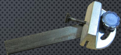
Optional Mitre Gauge