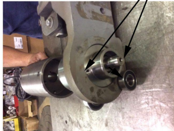
Threads for socket head cap screws. 1/4" ALLEN hex wrench